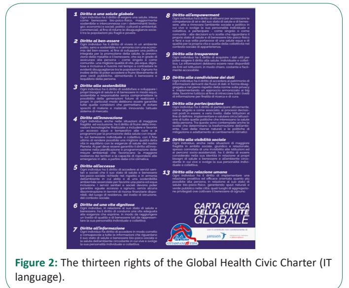
Figure 2: The thirteen rights of the Global Health Civic Charter (IT language).

The Charter also puts forwards 60 actions to follow to make the rights concrete and enforceable in these three areas. For